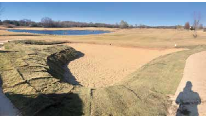
Bunker #10

This photo of the largest fairway bunker on #16 was taken November 9. The bunker was completely excavated with new and expanded drainage added.