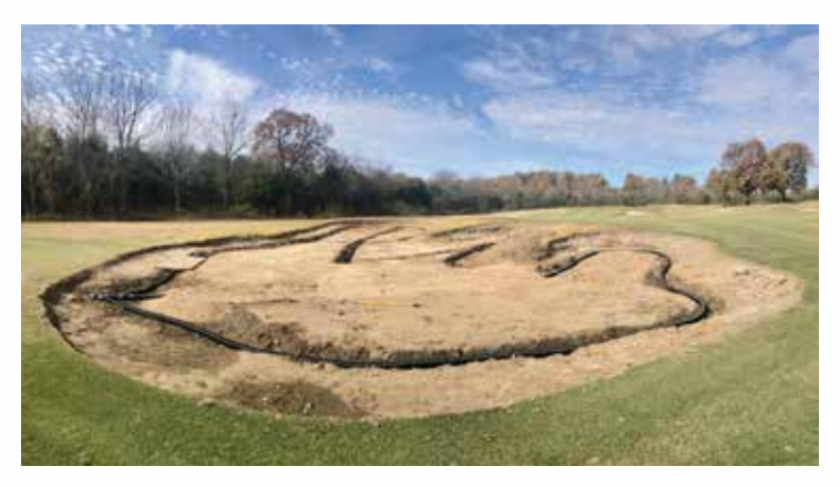
Bunker #16

This photo of the largest fairway bunker on #16 was taken November 9. The bunker was completely excavated with new and expanded drainage added.