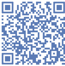
Play to Learn