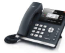
Yealink T4 series