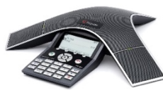
Polycom SoundStation Conference Phones