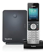
Yealink DECT Cordless