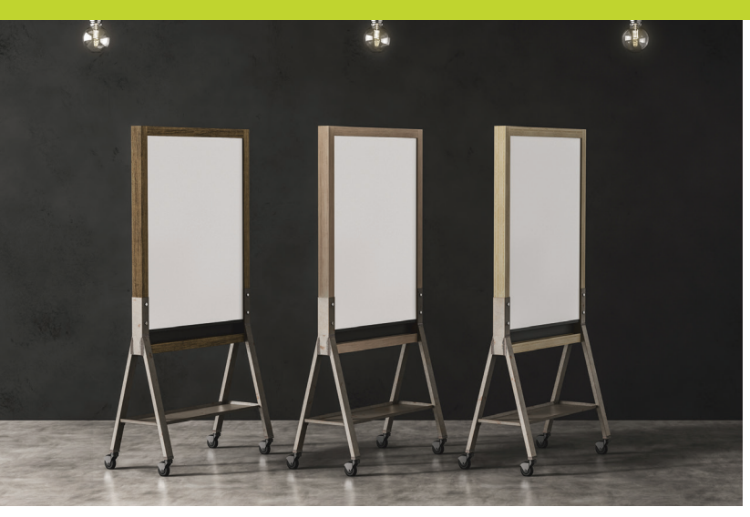
Partial height mobile with optional metal shelf