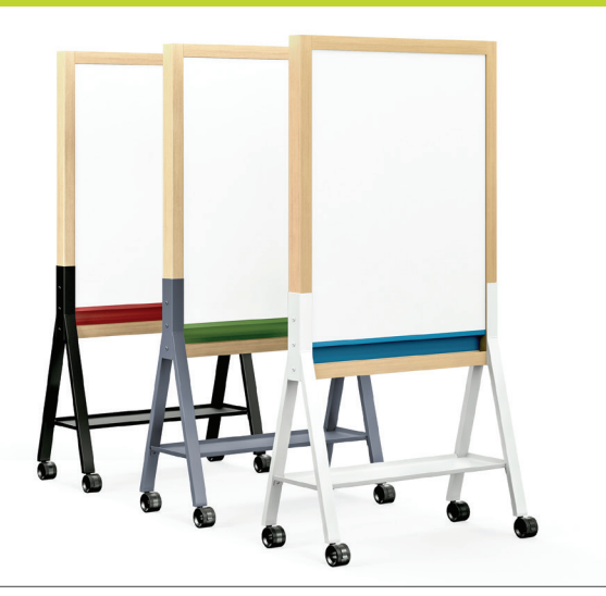
Partial height mobile with optional metal shelf