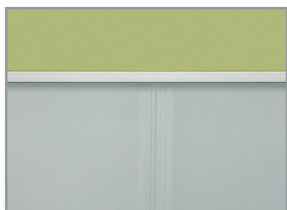
1/4" Face Trim and Mounting Detail