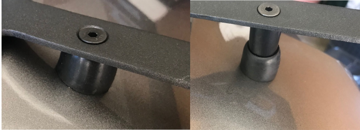
Rubber Mount once tightened to contour

The lock nut should be located at the end of the screw about 1/16" to 1/8" minimum beyond the plastic in the locknut.