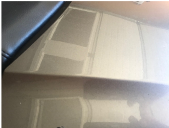
Rack Alignment Line

With a marker once, the template is lined with the upper straight edge, mark the two 5/16" holes. Do the same for the right side by simply flipping over the template and aligning as you did with the left side.