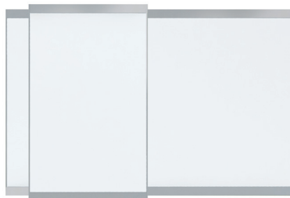
Sliding Panel Over Fixed Panel Markerboard