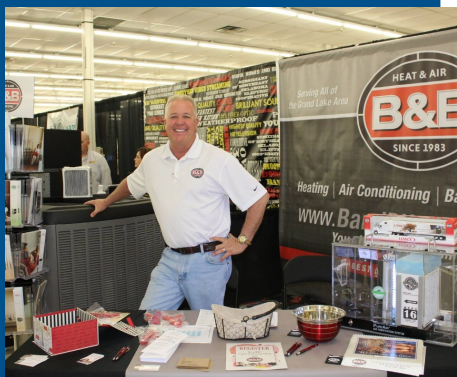
Home & Garden Show

Call the Chamber Office at 918-786-9079 to participate!