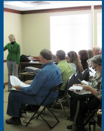
Small Business University