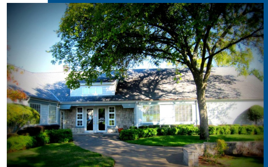
Chamber Office / Visitors Center

Your Chamber investment is one of the best values in business today. Membership has its privileges and we have dozens, with more being introduced all of the time. Your Chamber provides value and positive return on your investment many times over.