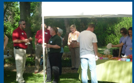
Business After Hours