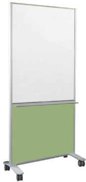
Markerboard / Tackboard Combination