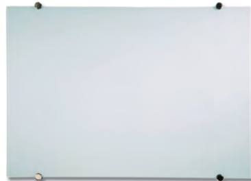
Edge-grip stand-off mount