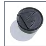
Rare earth magnet