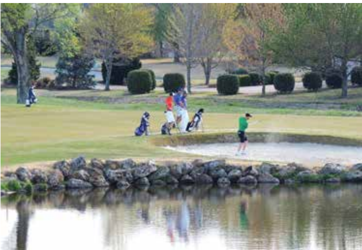
Photos from the Big Creek Members Putt-Putt Night