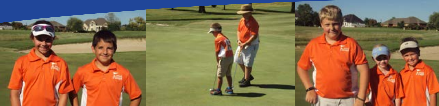
The Big Creek PGA JR League players won another fun match against the kids fro West Plains CC July 31st.