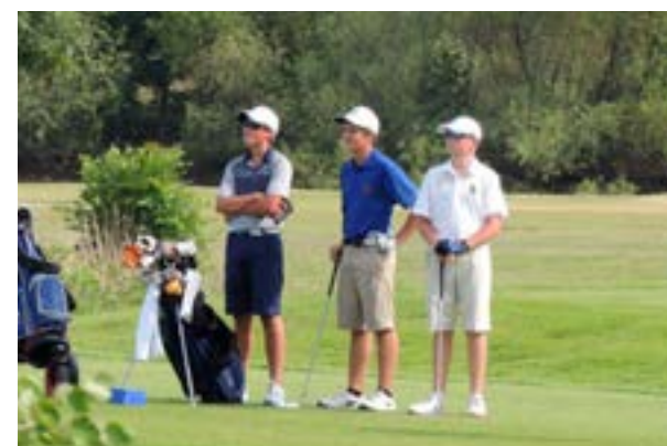
The "Ultimate Ford Bomber High School Invitational" was played on August 3rd & 4th, with schools competing from Mtn. Home, Searcy, Harrison, Shiloh Christian, Marion, Greenwood, Jonesboro, and Siloam Springs.