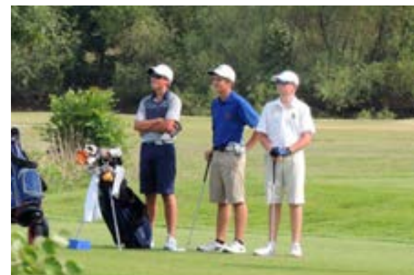
The "Ultimate Ford Bomber High School Invitational" was played on August 3rd & 4th, with schools competing from Mtn. Home, Searcy, Harrison, Shiloh Christian, Marion, Greenwood, Jonesboro, and Siloam Springs.