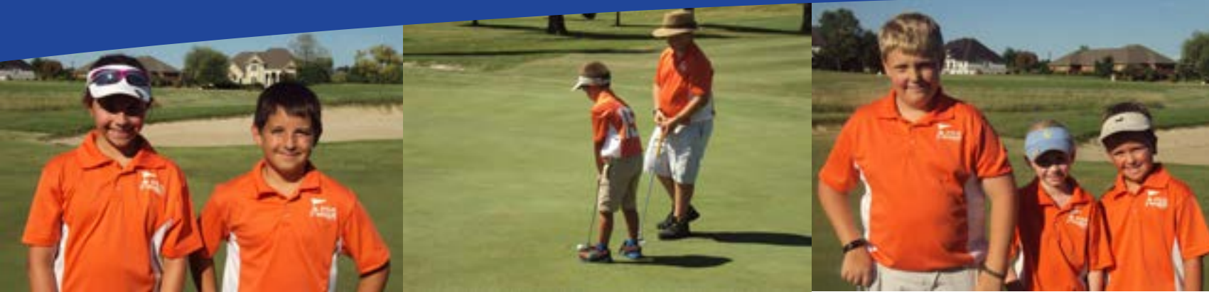
The Big Creek PGA JR League players won another fun match against the kids fro West Plains CC July 31st.